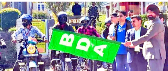
THE KASHMIR TALK BUREAU DODA:

In a remarkable initiative to boost tourism and promote adventure sports, Bhadarwah Development Authority (BDA) in collaboration with Adventure Hawks organized an interstate bike rally.