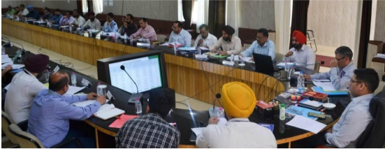
THE KASHMIR TALK BUREAU POONCH: