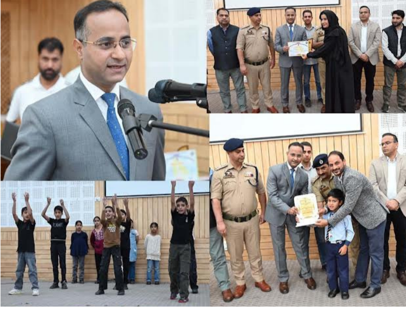
THE KASHMIR TALK BUREAU SHOPIAN:

Appreciates the work of stakeholders, praises people for record turnout during GELA, 2024