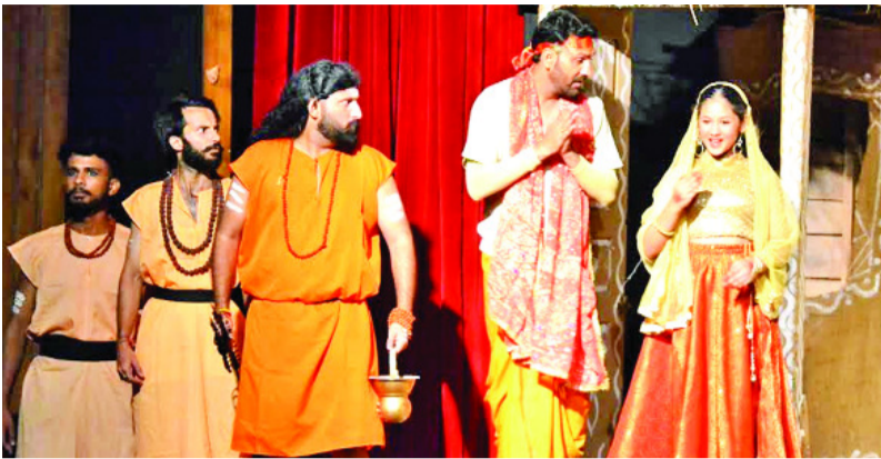
THE KASHMIR TALK BUREAU JAMMU: