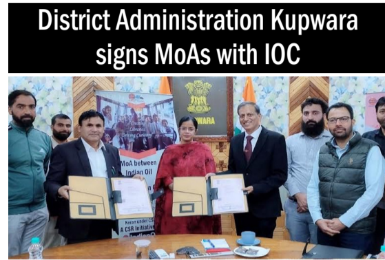
THE KASHMIR TALK BUREAU KUPWARA:

The District Administration Kupwara today organized a meeting of authorities of Indian Oil Corporation Limited (IOC) and concerned District Officers for commissioning of various equipment to block Keran under Corporate Social Responsibility (CSR).