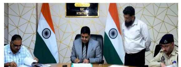
THE KASHMIR TALK BUREAU KISHTWAR: