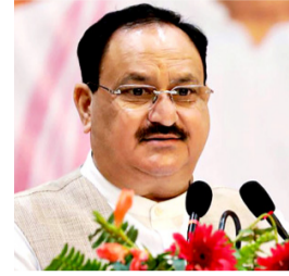
THE KASHMIR TALK BUREAU NEW DELHI:

BJP chief J P Nadda on Tuesday hailed the party's victory in the Haryana assembly polls and said the people have rejected the Congress' pitch for casteism, nepotism and dynastic politics, and voted for the BJP's development model under Prime Minister Narendra Modi's leadership.