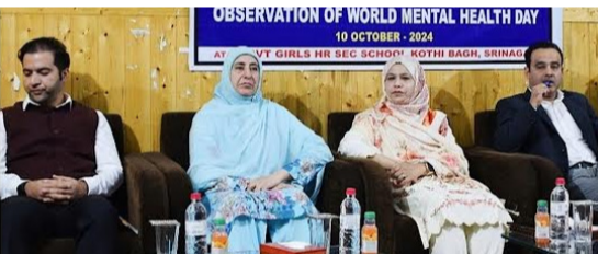
THE KASHMIR TALK BUREAU SRINAGAR:

The District Legal Services Authority (DLSA) Srinagar, in collaboration with Human Rights and Anti Corruption forum J&K HQ-Delhi Thursday organized an awareness programme on World Mental Health Day at Govt Girls Higher Secondary School Kothibagh.