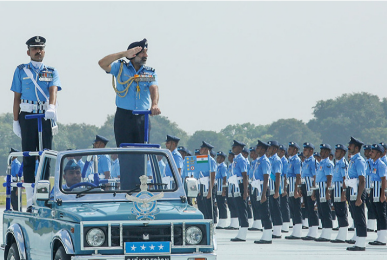
THE KASHMIR TALK BUREAU NEW DELHI:

Chief of Defence Staff Graces the Event; Chief of Air Staff Reviews Ceremonial Parade