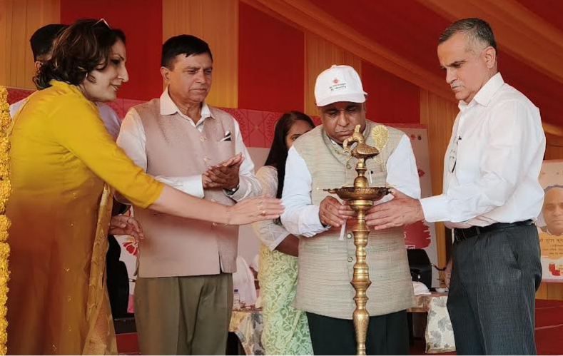
THE KASHMIR TALK BUREAU KATHUA:

Principal Secretary vows to preserve, promote historical glory of Basholi