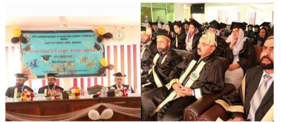
THE KASHMIR TALK BUREAU GANDERBAL:

VC SKUAST Kashmir urges pass-outs to think innovatively & contribute positively to society