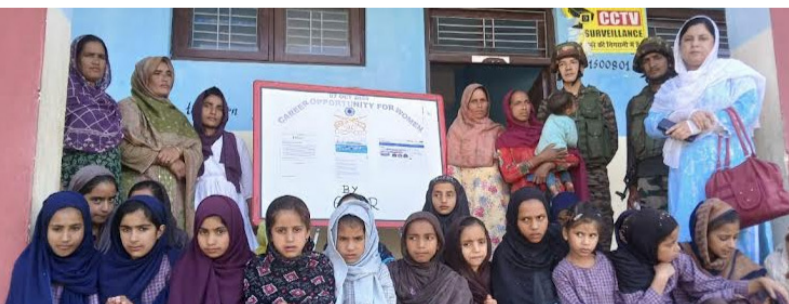
THE KASHMIR TALK BUREAU RAJOURI:

In a significant step toward women empowerment, the Indian Army organized a 'Lecture on Career Opportunities for Women' in Naili, Rajouri, aimed at spreading awareness and inspiring local females